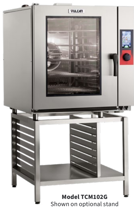
Model TCM102G Shown on optional stand